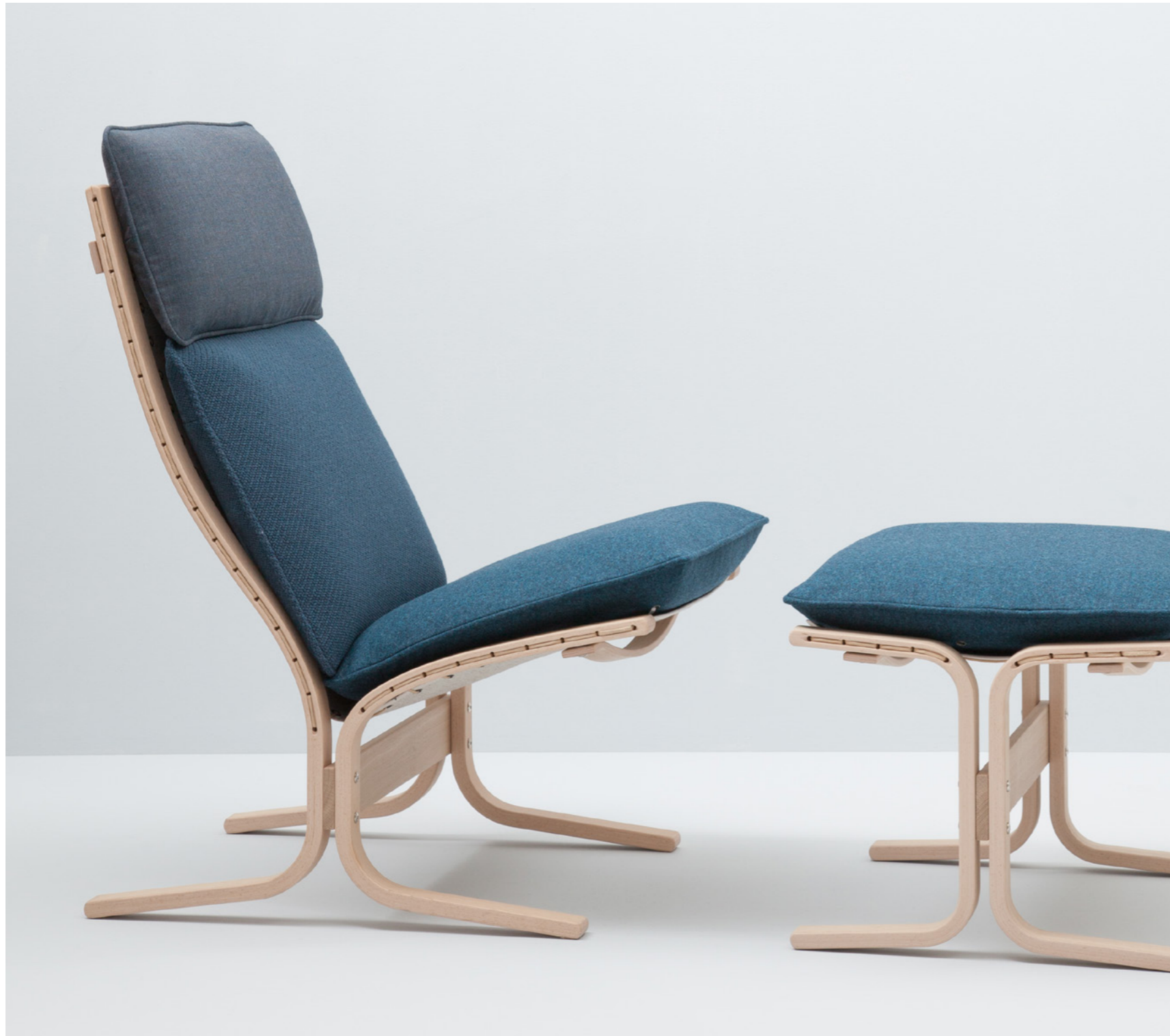
Siesta Trio by Ingmar Relling