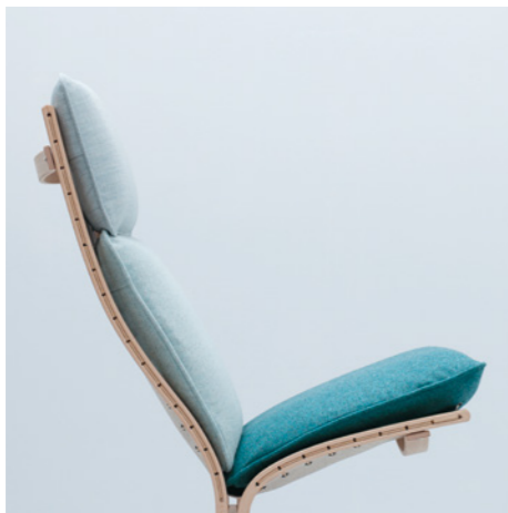
Siesta Trio by Ingmar Relling